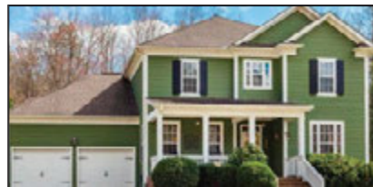
BILTMORE LAKE $569,000

4 BR/3 BA/3021SF MLS#3265943 www.rewnc.net/668274 D'Ann Ford (828) 277-5551 dford@carolinamountainsales.com Carolina Mountain Sales