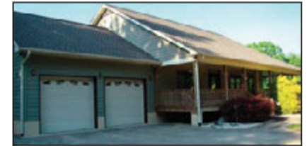
OLD FORT $599,000