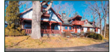
SPRUCE PINE $588,000