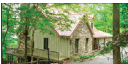
MARS HILL $549,000