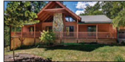
BLACK MOUNTAIN $599,000

51 Bear Track Loop 4 BR/4 BA/3706SF MLS#3217986 www.rewnc.net/620729 D'Ann Ford (828) 277-5551 dford@carolinamountainsales.com Carolina Mountain Sales