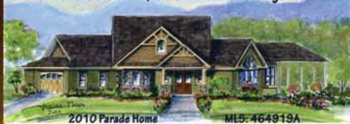
2010 Parade Home

4br/4.5ba 3850 sf $649k w elevator+ guest suite