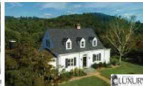
10CherryLane.com $649,500 MLS#3429489 Bed:4 BA:2/1 SqFt:2794 Acr:0.75