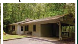
1030MiddleConnecteeTrail.com $215,000 MLS#3427232 Bed:3 BA:2 SqFt:1572 Acr:0.29