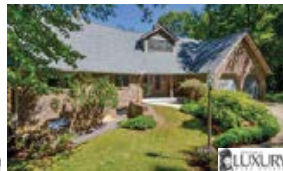
240HarmonyHillLn.com $674,500 MLS#3189311 Bed:4 BA:5/1 SqFt:5613 Acr:1.97