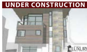
405WHaywood.com $729,000 MLS#3359951 Bed:3 BA:3/1 SqFt:2702 Acr:0.10