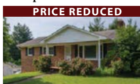
7DebraLane.com $296,300 MLS#3400674 Bed:3 BA:3 SqFt:1814 Acr:0.24