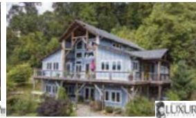
154WildsBranch.com $850,000 MLS#3432534 Bed:4 BA:3 SqFt:3946 Acr:46.36