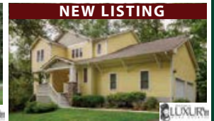
8BlueDamsel.com $599,000 MLS#3439964 Bed:4 BA:3/1 SqFt:3038 Acr:0.47