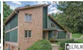
4HickoryLane.com $600,000 MLS#3429347 Bed:4 BA:3 SqFt:3443 Acr:1.30