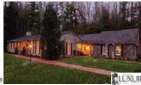
17BrooksideRoad.com $998,000 MLS#3362903 Bed:4 BA:3/1 SqFt:3686 Acr:1.66