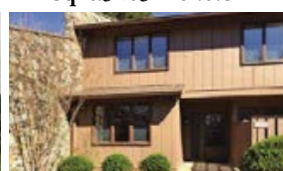
442Crowfields.com $243,500 MLS#3369831 Bed:4 BA:2/1 SqFt:2380 Acr:0