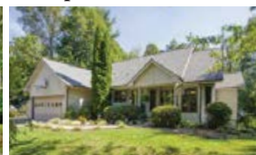
45EnglandWoods.com $379,900 MLS#3433645 Bed:3 BA:3 SqFt:3328 Acr:0.75