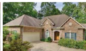
101WhiteCedarLane.com $387,500 MLS#3422271 Bed:3 BA:3 SqFt:3203 Acr:0.81