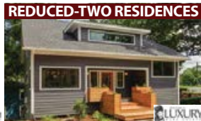
229FlintStreet.com $699,000 MLS#3424473 Bed:5 BA:3/1 Acr:0.07 SqFt:2020 Add'l SqFt:984