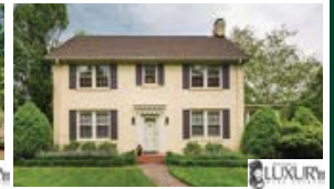
12NKensington.com $749,000 MLS#3392250 Bed:4 BA:2/1 SqFt:2807 Acr:0.40