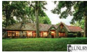
820TownMountain.com $1,999,999 MLS#3297945 Bed:6 BA:6/2 SqFt:6064 Acr:3.21