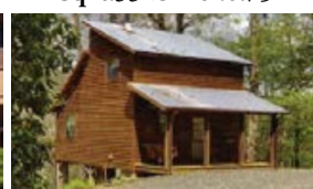
1074LeftForkRun.com $224,900 MLS#3391960 Bed:1 BA:1 SqFt:700 Acr:14.20