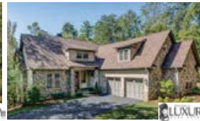
129OrvisStone.com $759,000 MLS#3435955 Bed:3 BA:3 SqFt:2725 Acr:0.07