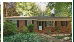
1ClearbrookRoad.com $319,000 MLS#3423157 Bed:3 BA:2 SqFt:1170 Acr:0.24