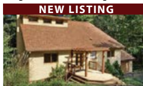
27GreenleafCircle.com $459,000 MLS#3438236 Bed:3 BA:3 SqFt:2226 Acr:0.66