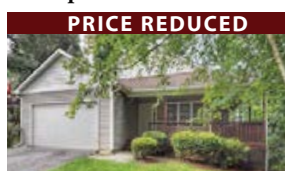
107GlenwoodHill.com $310,000 MLS#3410167 Bed:4 BA:3 SqFt:2648 Acr:0.30