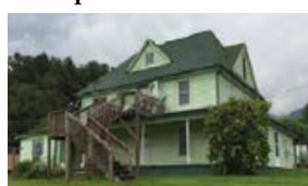
20-23CherryLane.com $275,000 MLS#3322044 Bed:6 BA:3/1 SqFt:1988 Acr:0.60