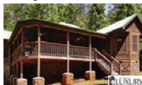
5LakeHaven.com $549,900 MLS#3395623 Bed:2 BA:2 SqFt:1413 Acr:9.45