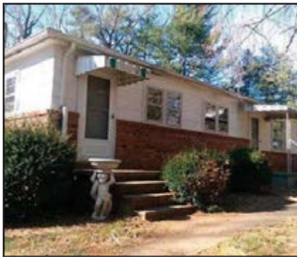
WEST ASHEVILLE Fully fenced one full acre 3+2, with detached garage and workshop, lots of flowers, trees and privacy. Dated but easily updated. This home can easily be converted to have a separate 1 bedroom 1 bath apartment. MLS#3266032 $225,000 www.rewnc.net/670573