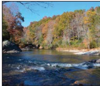
TOE RIVER Beautiful 1.33 acre lot ready to build. Fish from your back yard. Easy access from nice subdivision of estate homes. Possible additional lot. Must see to appreciate. $145,000 MLS#3171531 www.rewnc.net/581140