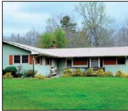
OTEEN Need space to stretch out. 1935 sq.ft. 1.6 acre level lot with workshop. Just outside the city so cheaper taxes but city services. Won't last long. MLS#3268738 $299,000