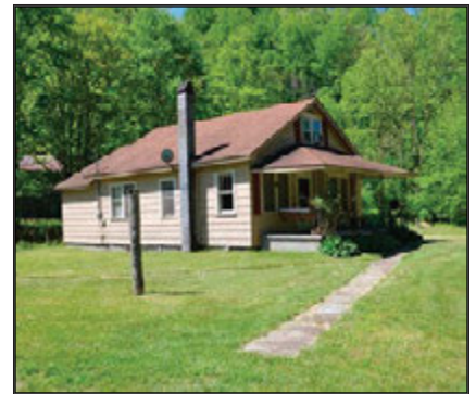
MARSHAL Tucked away in Shelton Laurel is your piece of heaven. If you are looking for your weekend getaway to fish off your back deck in a stocked trout stream, hike the Appalachian Trail that is just minutes from your home, or just sit and let sound of nature surround you, this is your place. MLS#3280752 $199,000 www.rewnc.net/684703