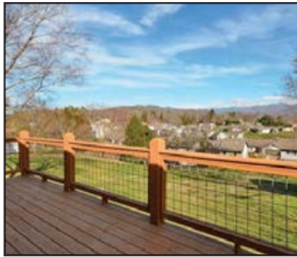
TOWN OF WEAVERVILLE Huge one level ranch home with amazing views. Completely renovated. Marble kitchens and baths. Full apartment in basement with outside entrance. .85 acre lot can be subdivided. Hurry this won't last long. MLS#3255177 $429,000 www.rewnc.net/659153