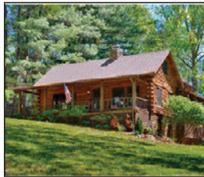
REYNOLDS If you are looking for country living but convenient to town then this is the place for you! Beautiful 3/2 log cabin with plenty of room for gardening on .91 acres. MLS#3275588 $289,900 www.rewnc.net/682764