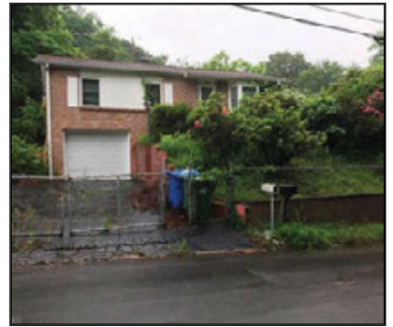
WEST ASHEVILLE! Walking distance to Haywood Road! This home has solid bones and is just waiting for a new owner with a vision for interior remodeling. INVESTOR/HANDYMAN SPECIAL MLS#3284264 $195,000 www.rewnc.net/684666