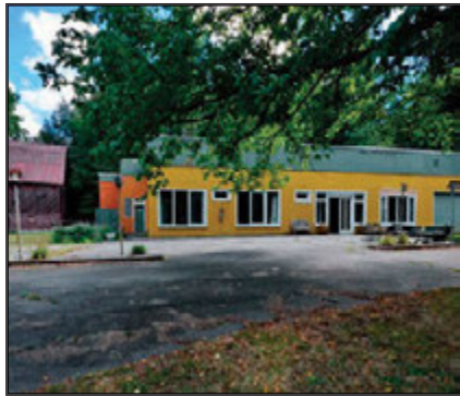
WEAVERVILLE. Live/Work/Play. 4450 sq.ft. Studio/Warehouse home with large workshop areas. Separate retail space. Nice barn, 2.5 acres MLS#3259311 $335,000 www.rewnc.net/662803