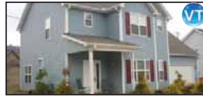
TRADITIONAL 2 STORY in attractive south neighborhood. Close to restaurants and shopping. Close to interstate. Additional room could be finished. Garage is 460 sq ft. $190,000 www.rewnc.net/774548