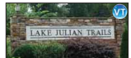
BEAUTIFUL TOWNHOME Incredible value in the last phase of this popular south subdivision. 3 bed 3 bath. Convenient to shopping, I-26 and Asheville Airport. $160,000 www.rewnc.net/759447