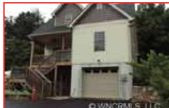
BUILDER'S HOME. This House location offer Privacy, Security, Convenience. Dwnthwn West Asheville within walking distance! Kitchen wood cabinets & stainless steel appliances. Lg MBR 1st floor, Soaking Tub in MB Bath. Lots of windows thruout house. Sgl oversized garage. Large side to back yard for kids, animals & entertaining. Plenty of Parking Space. NO thru traffic living on a culdesac. Can buy extra lot (.25) addtl! $25,000 see MLS 469374. www.rewnc.net/781883