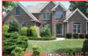
BEAUTIFUL BRICK HOME IN CULDESAC IN THE COTSWOLDS. Dramatic 2 story foyer invites you into the dining room and great room with fireplace and lots of natural light. Owners suite features connected office, bath with garden tub, dual vanities, walk-in closet. Kitchen with island, granite, pantry and all appliances open to great room and rear deck for entertaining. Upstairs bedrooms with jack-n-Jill bath, one with private bath. Great landscaping. www.rewnc.net/781940