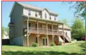
GREAT HOME WITH WONDERFUL LEVEL YARD, BASEMENT WITH WIRING OR PHONE AN New carpet installed in living room! Tray ceilings in the master bedroom and dining room. Natural gas line has been run to the basement for additional fireplace. www.rewnc.net/781942