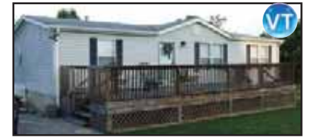
SHORT SALE OPPORTUNITY on this immaculate manufactured home on permanent FHA approved foundation. Pre-qualification letter or proof of funds to accompany all offers-all terms and conditions require bank approval. $95,000 www.rewnc.net/774545