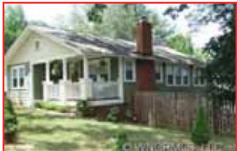
CHARMING ARTS & CRAFTS BUNGALOW IN OAKLEY HAS BEEN RENOVATED AND UPDAT Relax on the rocking chair front porch, entertain in the spacious light filled dining room and living room with fireplace. Hardwood flooring is refinished, new kitchen with all appliances, 2 new bathrooms, new roof, new windows and new heatpump. Dry unfinished basement with possibilities. MLS:470875 www.rewnc.net/781939