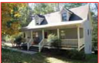
TRADITIONAL CAPE COD NESTLED IN A QUIANT NORTH ASHEVILLE NEIGHBORHOOD. Enjoy the inviting rocking chair front porch with pvt setting and large level side yard perfect for gardening and entertaining. Bright spacious home has hardwood floors and open floorplan. Master on main with guest rooms upstairs and bonus room with full bathroom in daylight basement. You will love the convenient location with easy access to grocery and Weaverville schools. www.rewnc.net/781882