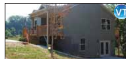
OAKLEY Brand spankin new craftsman style bungalow in desirable Oakley community. Close to shopping and town. Beautifully done additional living space. Portion of above PIN/portion of above deed book/page. $179,000 www.rewnc.net/746140