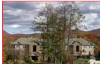
DESIGNER APPOINTED IMMACULATE TURN-KEY 2ND FLOOR CONDO on the quiet side of the building looking into the Mountain Forest. 5 mins to downtown, 2 & 4 miles from I-40 and Blue Ridge Pkwy, Walk to Biltmore Village, Fully upgraded, cherry hardwood fls, Lighting, Master Ba Shower Upgrade, all Whirlpool Designer Appliances convey, Crown moldings, large 5x9 balcony 4x10 storage closet, New paint. MLS:453410 www.rewnc.net/781920