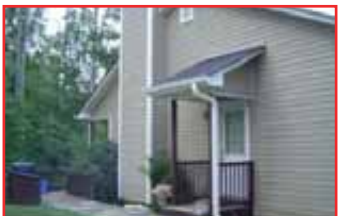
ONE LEVEL LIVING IN SECLUDED/WOODED SETTING IDEAL FOR NATURE LOVER. Great fenced area for dogs. NATIVE STONE wood-burning fireplace, crown moulding and tilt windows. Ceramic tile in all rooms except laminate in bedrooms and hallway. Covered decks. www.rewnc.net/781887