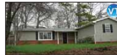
3 BEDROOM 2 BATH HOUSE on 1.53 acres with a commercial bldg perfect for mechanics garage, art studio, storage, etc. $170,000 www.rewnc.net/769039