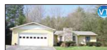
ARDEN -Attractive ranch home on beautiful lot. 3/2 New refurbished inside with eat in kitchen, dining area, split floor plan, fireplace, and more! Must see. Huge covered deck for private outdoor living. $220,000 www.rewnc.net/721591