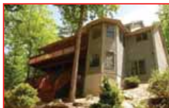
SPECTACULAR MOUNTAIN VIEW from massive 2 story decks, great room w beamed cathedral ceiling & huge stacked stone fireplace, master BR on main w tray ceiling, custom tiled bath w large glass shower, hardwood floors thru-out main level, guest suite downstairs, bonus room above 2 car main level garage, stone & hardi-plank exterior, central humidifier & air cleaner, Absolutely beautiful 1.66 acres of exquisite stonework gardens, walkways & walls. www.rewnc.net/781879