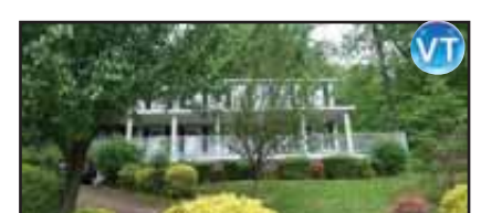
GROVEMONT Short Sale-2 story home w/large, covered front porch w/mountain views. 4 bedroom, 2.5 bath, formal dining room, eat-in kitchen, Brazilian cherry laminate, living room and den. Beautifully landscaped lot. $195,000 www.rewnc.net/717624

Ask Us about Our Success in Making Short Sales Work!