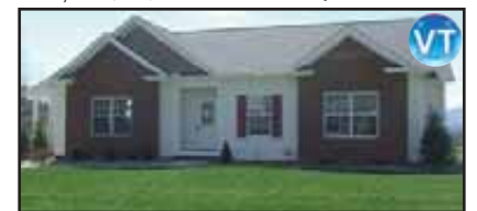
COME SEE THIS BEAUTIFUL MODEL HOME. Richly appointed and views that will "WOW" you! $279,999 www.rewnc.net/765372