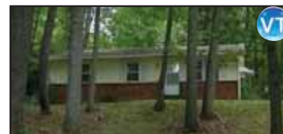
RANCH STYLE 3 Bedroom 1.5 Bath home on .30 acre level corner lot. $115,000 www.rewnc.net/774534