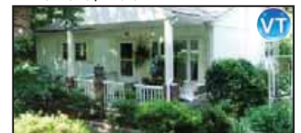
CUTE AND COZY BUNGALOW in Biltmore. Two of the original three bedrooms have been combined to make 1 spacious master suite. Florida room is heated for year round enjoyment overlooking private level backyard. $140,000 www.rewnc.net/771813