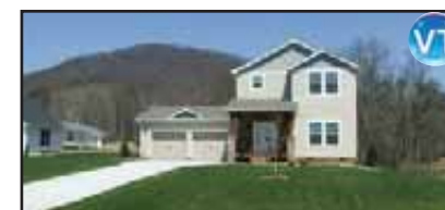
IF YOU ARE LOOKING FOR a wonderful eat-in kitchen, an open floor plan, stainless appliances in a brand new home w/unbelievable views, this should be your first stop. Don't forget to spend a few minutes on the deck listening to.....nothing. $259,999 www.rewnc.net/765371