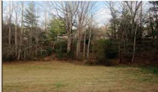
SELLER WILL CONSIDER INSTALLING A WELL

WATER METERS IN cuts in, sidewalk in, Sewer Easement approved, also approved for 2 duplexes survey attached. Owner can build anything that fits in setbacks and falls under C1 zoning. Absolutely great lots for investor or for someone that wants to live in one and rent the other. Can be sold separately for $90,000 each MLS:3379151 www.rewnc.net/567042