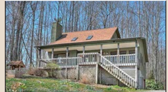
UNDER CONTRACT -- SHOW

RS4. ZONING, PLANNING & Zoning say 1 house could be built here. There is a stream and 6" sewer line at front of property, 2" water line, includes buffer for stream & 20 sewer easement! This is a fabulous piece of property, great place for a new home in popular South Asheville! Buyers Attorney to hold Earnest Money. MLS:3337760 www.rewnc.net/724001